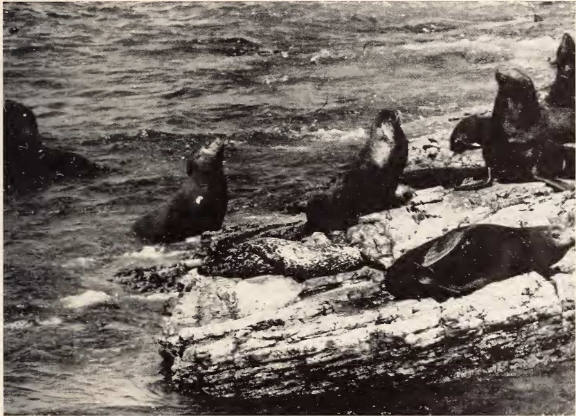
Fig. 8. Bull California sea lions on the right with female Steller sea lions in the water to the left and a harbor seal lying on the edge of the rock in the center of the picture. Año Nuevo Island, California, August 18, 1962

In the months of December, January and February, when the elephant bulls are aggressive and active breeding is occurring they seem to pay no attention whatsoever